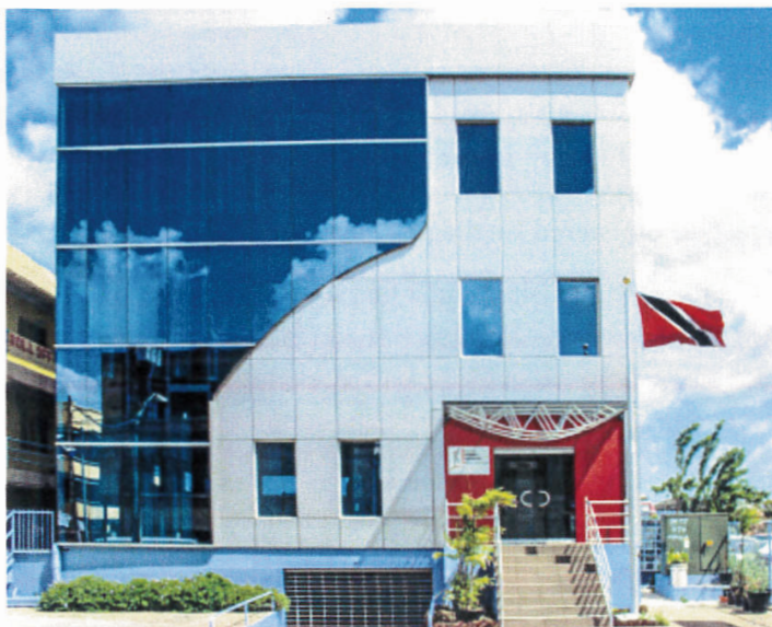
GHRS new office located at 16 Mulchan Seuchan Road, Chaguanas

There are no reports to be published under this section.