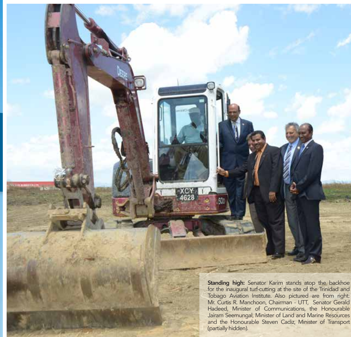
Standing high: Senator Karim stands atop the backhoe for the inaugural turf-cutting at the site of the Trinidad and Tobago Aviation Institute. Also pictured are from right: Mr. Curtis R. Manchoon, Chairman - UTT, Senator Gerald Hadeed, Minister of Communications, the Honourable Jairam Seemungal, Minister of Land and Marine Resources and the Honourable Steven Cadiz, Minister of Transport (partially hidden).