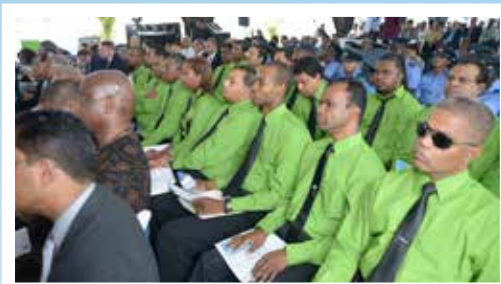
A cross-section of graduates from the Avionics Trainee Engineer programme