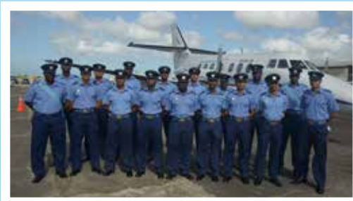
Graduates from the Trinidad and Tobago Air Guard